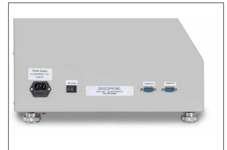
Interface for data transmission from the SAUTER FH measuring device and for controlling the test stand with SAUTER AFH software