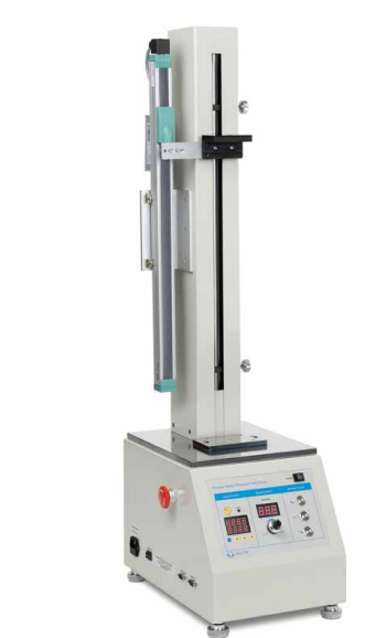
Motorised test stand incl. length measuring system LD