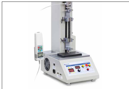
Solid and flexible fixing options for many clamps and accessories from the SAUTER product range, see Accessories