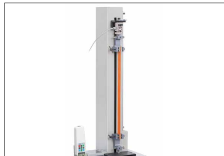
A wide range of application possibilities because of its large travelling distance